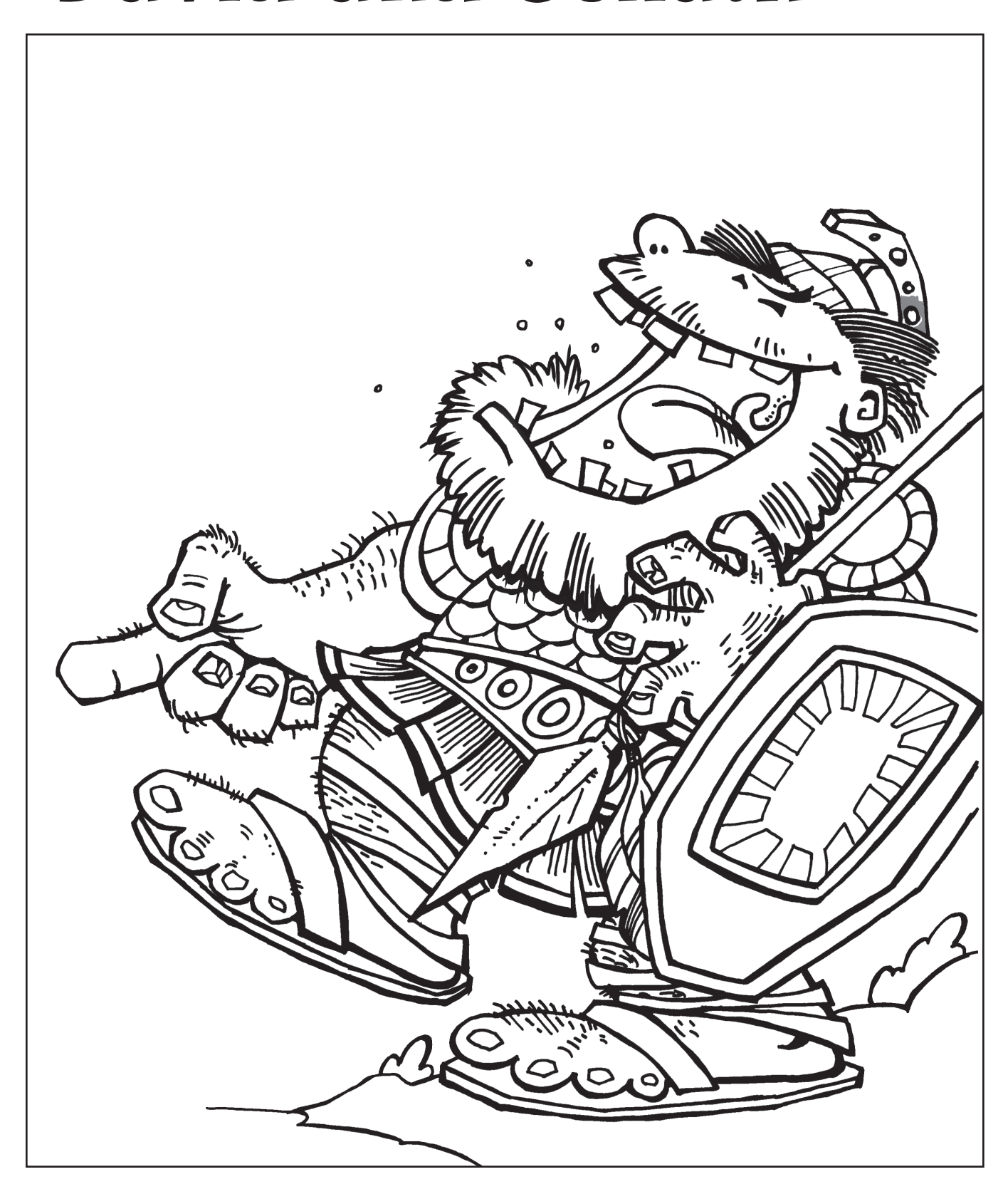
Goliath laughed when he saw David.