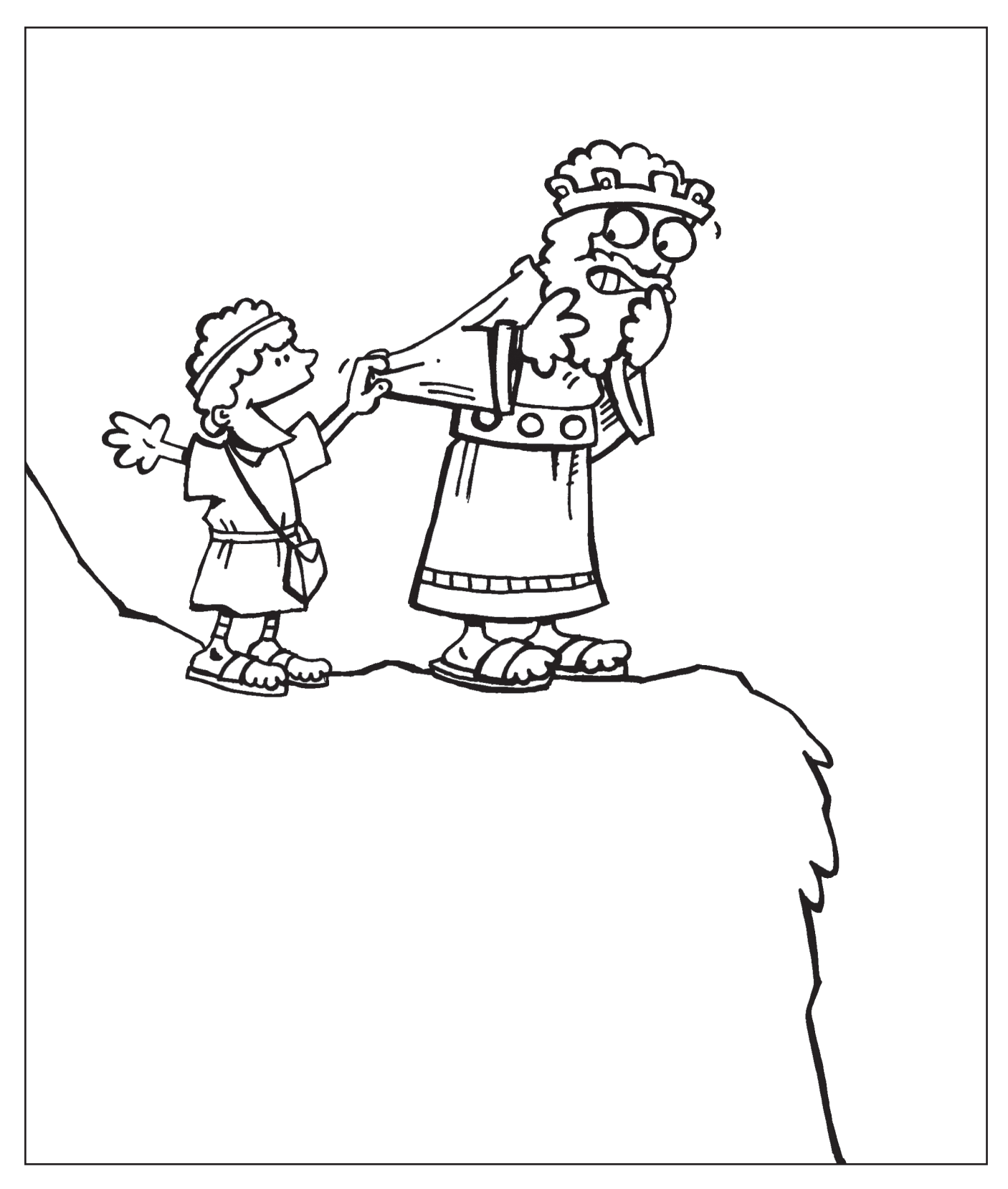
David said, "I will fight Goliath."