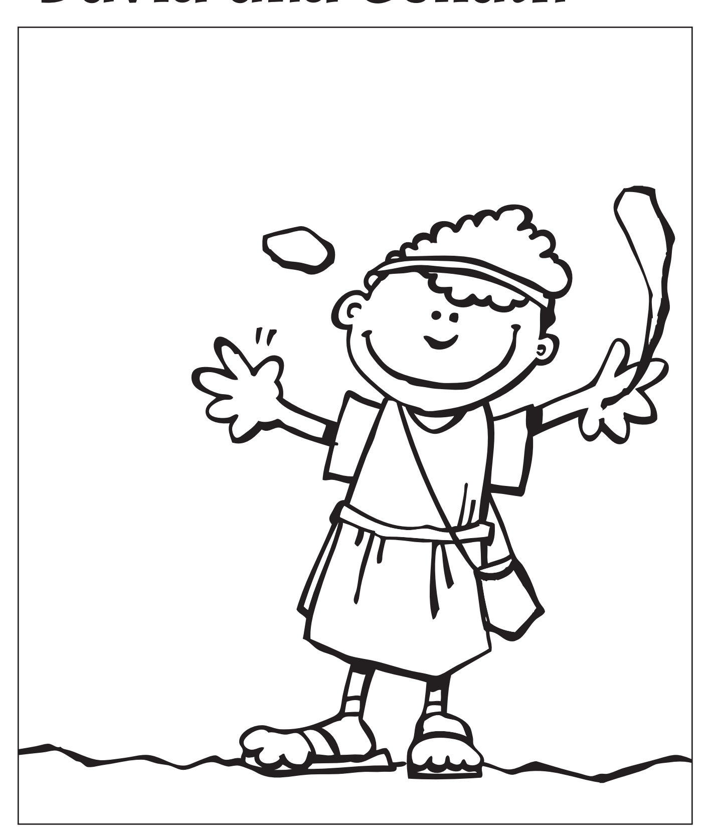
David, a small shepherd boy, had beaten the mighty Goliath.